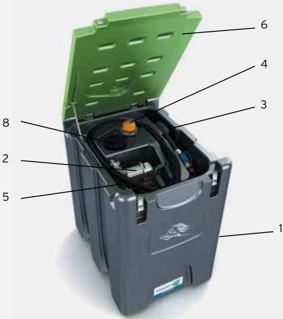
TruckMaster® 300 L

● Standard accessories. ○ Optional accessories.