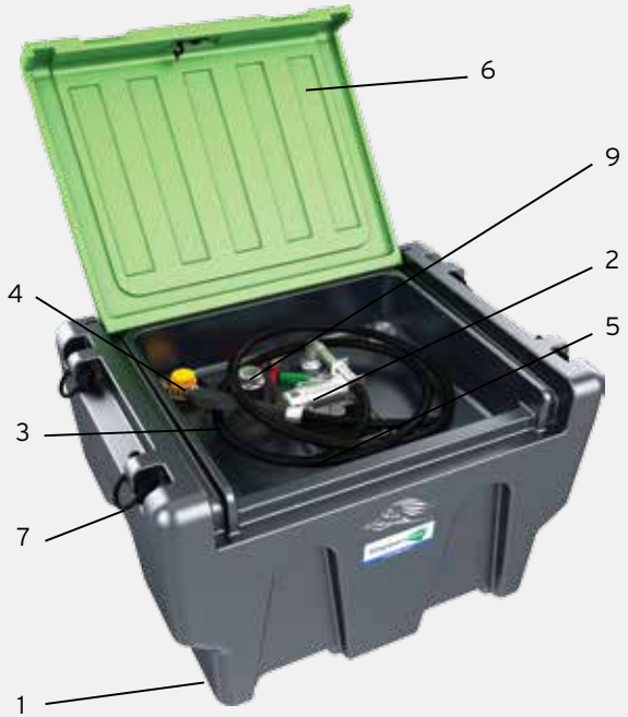
TruckMaster® 430 L